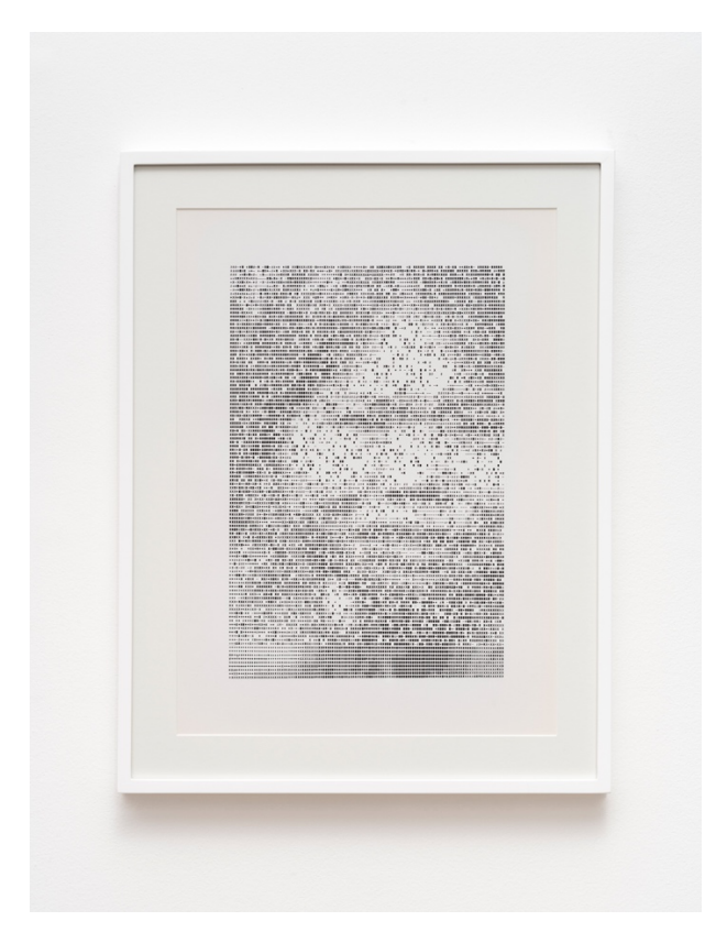
Waldemar Cordeiro, The Woman is Not B.B. ( Brigitte Bardot ), 1971